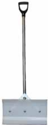
KCF1618SC Snow Shovel with D-grip handle.

ORDERING INFORMATION: Please specify handle preference when ordering. Available in Steel, Steel with D-grip, or wood.